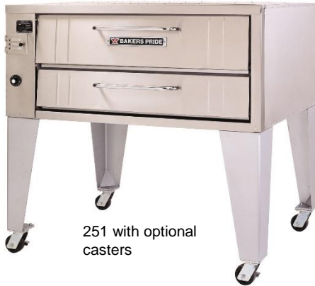
251 with optional casters